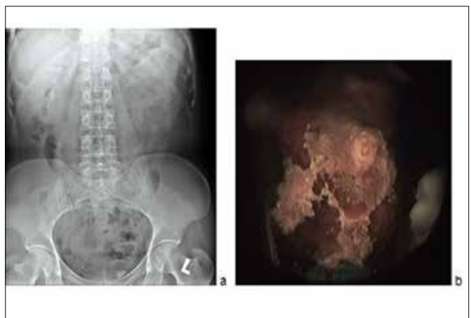
Figure 1. A. Intravenous pyelography with visible stone in the urinary bladder on the left side. B. Endoscopic image of a stone in the bladder. Patients after tension-free vaginal tape implantation.

The age of the patients treated using the Pereyra method ranged between 47 and 56 years (average 51.5), and those treated by TVT ranged from 57 to 71 years (average 64). The time span between SUI procedure and bladder stone treatment for women treated by the Pereyra method was 8.5 years and 1.7 years for TVT treated women. The diameter of the stones ranged from 1.7 to 3.5 cm (average 2.6) for the Pereyra method treated women and 1.6 to 3.0 (average 2.3) cm for the TVT treated women (Table 2). Stone disintegration through the use of the Ho:YAG laser was performed endoscopically; the stones were fragmented and suctioned out, followed by thread and/or tape excision from the interior of the bladder. The holmium laser was rated at 80 W and the length of the light-ray was 2,100 nm. The range of applied energy ranged from 0.2 to 3.5 J, and frequency from 5 to 60 Hz. The optic fiber used for stone fragmen-