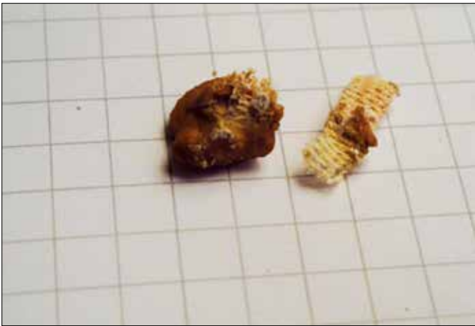
Figure 4. Stone and part of the tape after removal from the bladder by using holmium laser on as endoscopic procedure.