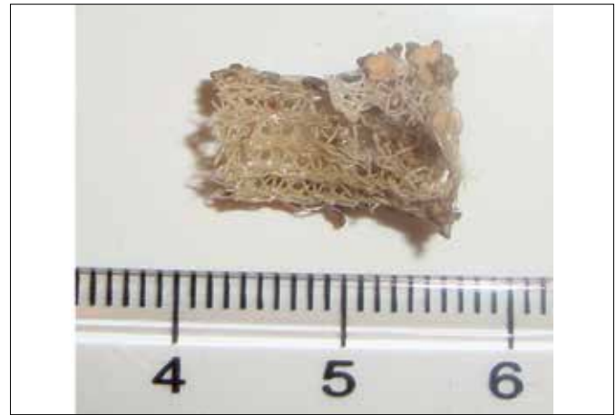
Figure 5. Part of the tape with a few small stones on the surface after removal from the bladder by using holmium laser as endoscopic procedure.

literature mentions the application of electroresection [9, 10, 11]. In these cases the opportunity to perform two procedures with the Ho:YAG laser was taken i.e. to disintegrate stones anchored to tape or thread fragments in the bladder and to excise said fragments.