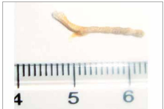
Figure 3. A piece of thread excised from the bladder of the patient who underwent Pereyra procedure.