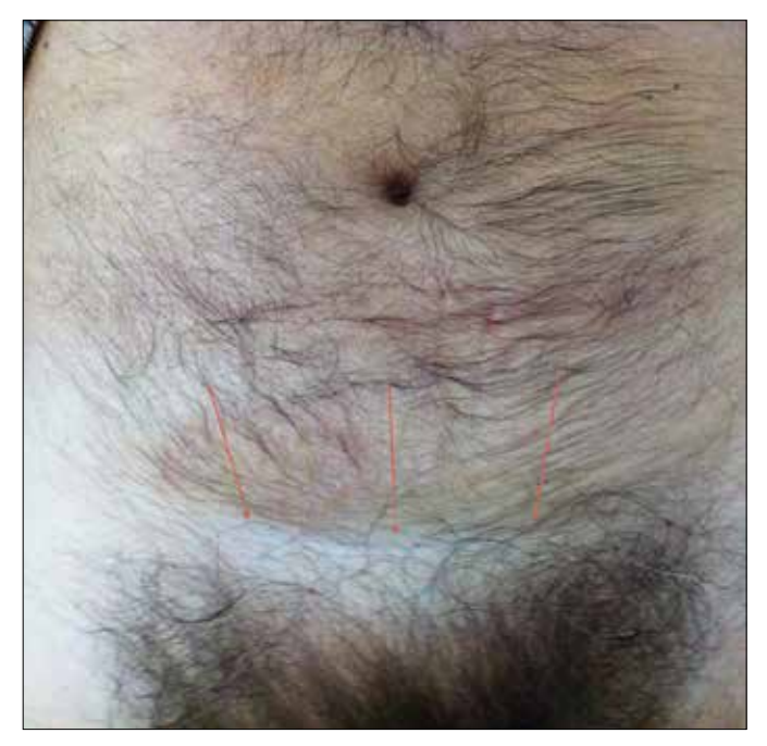
Figure 3. A barely visible scar after Pfannenstiel incision (3 arrows). Additionally, if the patients wear underpants or bathing trunks, it is completely hidden.

This approach offers excellent exposure of the surgical field. The obtained surgical field enables an excellent exposure for the prostatectomy procedure, independent if either nerve sparing or a lymphadenectomy is performed (Figure 1). Another further advantage is, that the incision can be extended in length if necessary in case of the patients body weight, without scarring the abdominal wall above the belt line. The time for surgery is comparable with any other approaches, depending on the experience of the surgeon. Blood loss and surgical margins were not examined, because we described the approach and the method of the prostatectomy according to the technique by Walsh [1]. Healing and cosmetic results are superior using the Pfannenstiel approach [9]. Furthermore, the laparoscopic and robotic-assisted radical prostatectomy