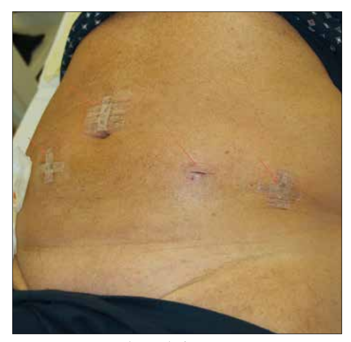
Figure 2. Five scares (arrows) after a da Vinci radical prostatectomy, distributed on the abdominal wall. In the middle the enlarged for organ entrapment and further four trocar incisions.

This approach offers excellent exposure of the surgical field. The obtained surgical field enables an excellent exposure for the prostatectomy procedure, independent if either nerve sparing or a lymphadenectomy is performed (Figure 1). Another further advantage is, that the incision can be extended in length if necessary in case of the patients body weight, without scarring the abdominal wall above the belt line. The time for surgery is comparable with any other approaches, depending on the experience of the surgeon. Blood loss and surgical margins were not examined, because we described the approach and the method of the prostatectomy according to the technique by Walsh [1]. Healing and cosmetic results are superior using the Pfannenstiel approach [9]. Furthermore, the laparoscopic and robotic-assisted radical prostatectomy