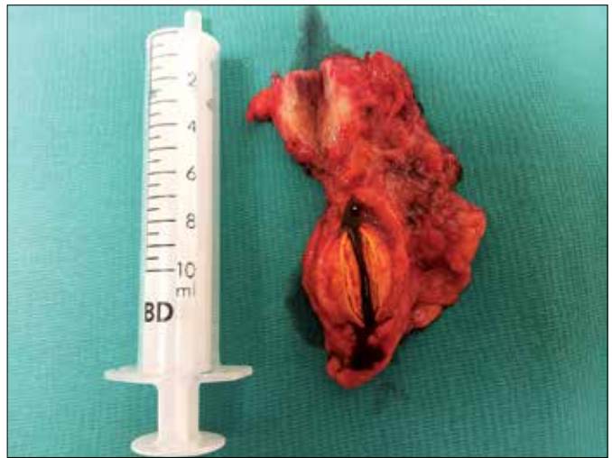
Figure 2. The postoperative specimen.

catecholamines in serum and the level of metoxycatecholamines in 24 daily urine samples were within normal limits in four weeks since adrenalectomy. In the pathological examinations, adenoma was found in the adrenal gland, while the tumor close to celiac trunk was found to be a synaptophysin- and chromogranin-positive pheochromocytoma. Furthermore, in the surrounding tissues, few lesions of ganglioneuroma character were found. At present, the patient is asymptomatic and is regularly followed-up.