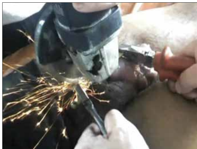
Figure 2. Cutting the CD by means of angle grinder.

The patient's condition after the procedure remained satisfactory without hemorrhages, burns, or injury of the penile tissues. He was able to micturate within 30 minutes of CD removal. The swelling and tenderness decreased by the 2 nd day following the