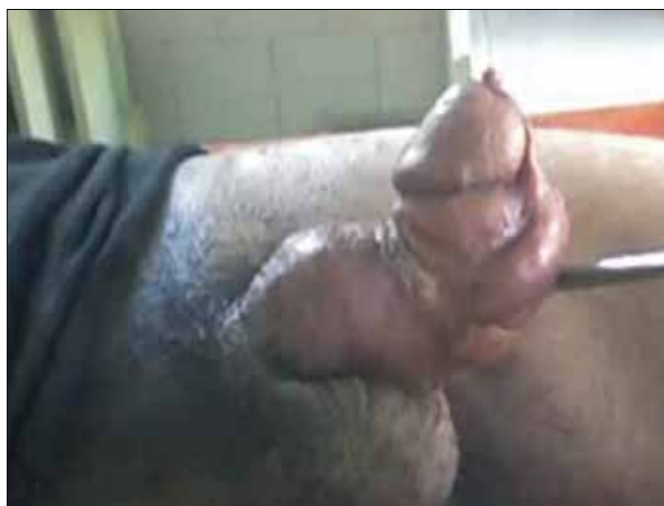
Figure 4. Any signs of hemorrhages, burns, injury of the penile tissues were registered. Penile edema was present until the 2 nd day after CD removal.

procedure. The patient complained only of mild paresthesia at the glans penis and urethra. After one month he had no complaints of micturition problems or sexual disorders.