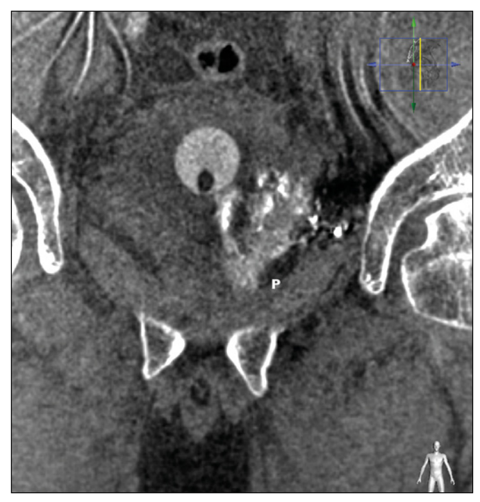
Figure 3. Coronal reconstruction of the Cone Beam CT during the procedure. Contrast injection through the microcatheter in the prostatic artery depicts the enhancement of the left prostate (P) lobe. No enhancement of the adjacent structures confirms the minimal risk of non-target embolization.

ing in one patient exclusively at a second attempt. Liguori et al. [39] and Delgal et al. [25] performed repeat successful procedure in 5 (11%) and 3 (16,7%)patients, respectively. Clinical success was defined as a cessation of hematuria except for Malling et al. [38] study. The authors reported no major complications related to PAE. Minor complications revealed in the literature ranged from 10-50%. Postembolization syndrome (i.e gluteal pain, fever, nausea, emesis) [25, 33, 34, 38, 39] was managed with symptomatic treatment approach only, with its resolution within few days. Embolization of the main trunk or whole anterior or posterior divisions of the internal iliac artery, compared to superselective embolization as distal as possible, increased a chance of ischemic complications. When the gluteal artery was not protected buttocks and upper tights pain could occur as a complication [39, 40]. Rastinhead et al. [6] reported an individual case with rectovesical fistula one month after embolization. The complication was related to prior advanced cancer status with rectum invasion. One microcoil migration from the anterior division of the internal iliac artery [25] and singular case with a pseudoaneurysm of the common femoral artery [40] had been described in the studies. Malling et al. [38] used CIRSE classification system