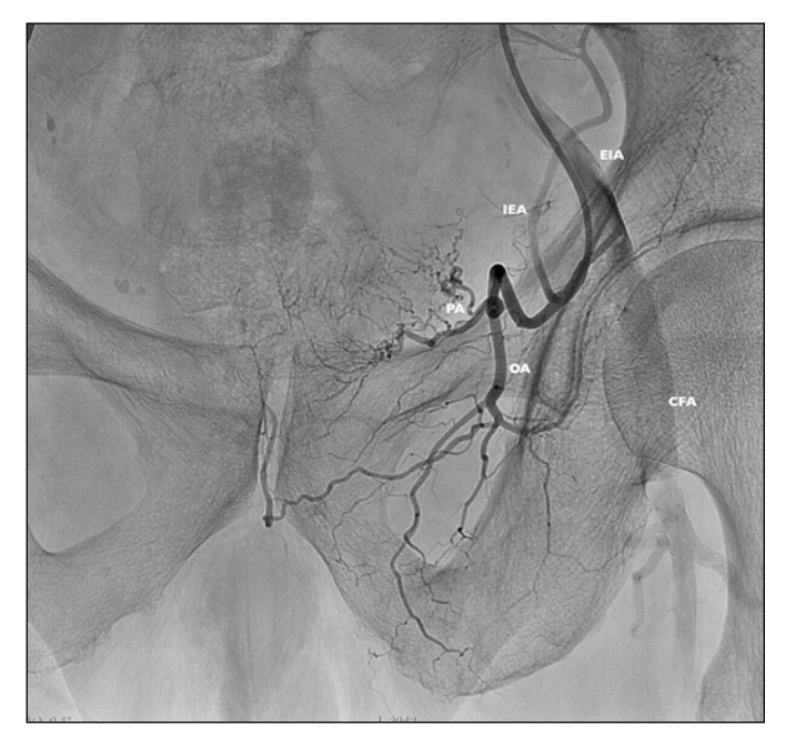
Figure 1. Selective angiography of the left inferior epigastric artery (IEA). In this less common pattern left prostate artery (PA) originates from obturator artery (OA) which is a branch of IEA in this case. CFA – common femoral artery; EIA – external iliac artery.

Prior to prostate artery embolization (PAE) procedure, patient is referred for computed tomography angiography (CTA), to verify pelvic and prostatic arterial anatomy and identify collateral vessels [20–23]. Detection of active bleeding is not an obligatory finding to proceed with PAE in patients with refractory cancer hemorrhage [5, 24, 25]. Because vascularity in this area is highly diversified, it is particularly important to become familiarized with possible disparities and anastomoses. That enables to perform selective catheterization avoiding untargeted occlusion which yield undesirable ischemia [19, 22]. According to current findings, the probability of the occurrence of single prostate artery from each pelvic side is 57% and double independent arteries arise from both sidewall occur in 43% of patients [26]. One patient on both sides can present different amount of the arteries.