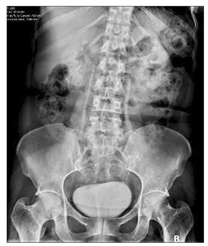
Figure 1B. Urography preformed after ureteral reimplantation.

was 5.7 months (1–14). This wide range of time to reparation is due to a patient with a delayed ureteral reimplantation due to a misdiagnosed ureteral lesion