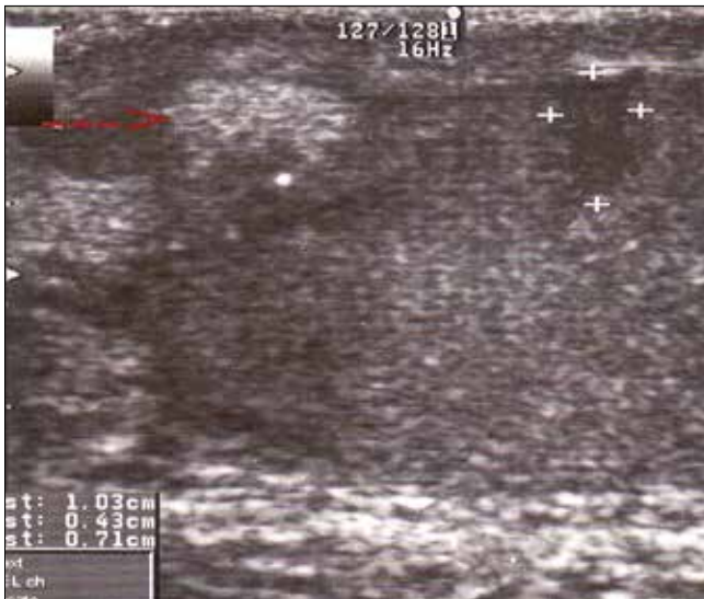
Fig. 2. Abscess of epididymis (marked by red arrow) and hypoechoic areas in testis (marked by +).

stage IIIB of AEO, initial conservative treatment was not effective so the patients underwent surgery.